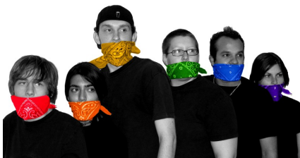
The Annual Day of Silence occurs every April 15th in protest of the actual silencing of the LGBT community through bullying & harassment.

The CVTC Pride Alliance organizations, which provides academic and social support to the LGBTQIA community and their allies, will participate in the annual Day of Silence organized by the Gay, Lesbian & Straight Education Network. Students will take a voluntary oath of silence throughout the day to protest the silencing of LGBTQIA students that occurs through bullying and harassment.