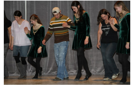
CVTC students were invited on stage to learn a traditional Irish soft toe dance!