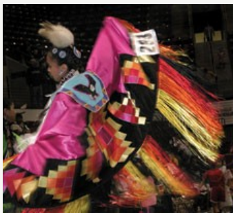
A Women's fancy shawl dancer glides across the arena at the Honoring Diversity Pow-wow at UW-Eau Claire last April.

The CVTC Diversity Student Organization (DSO) voted to support the annual Honoring Diversity Pow-Wow at UW-Eau Claire by donating $500 to the Native American Stu-