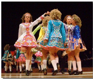
Stop by the reception for great food, fun, and while you're at it, try out one of many traditional Irish dance steps!

Diversity Services, along with the Diversity Student Organization, will host an Irish American Heritage Month Reception at CVTC